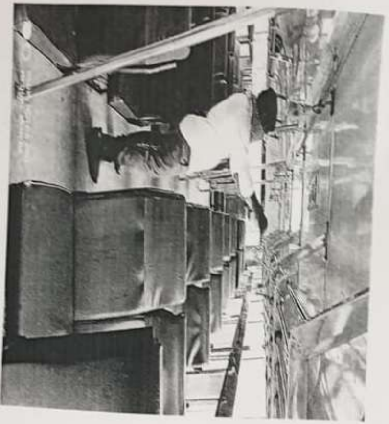
Spraying sodium Hypochlorite mixture in Chennai vehicle to avoid Corona virus at Satyaveedu depot